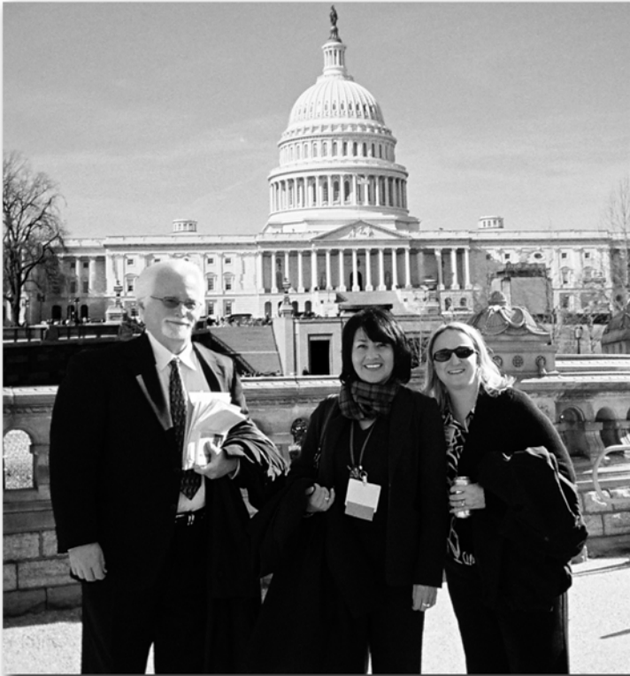
In front of the Capitol Building